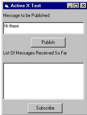
FIGURE 10-1 Sample VB Application using ActiveX Controls

The following code shows the basic setup needed to create a sample application: