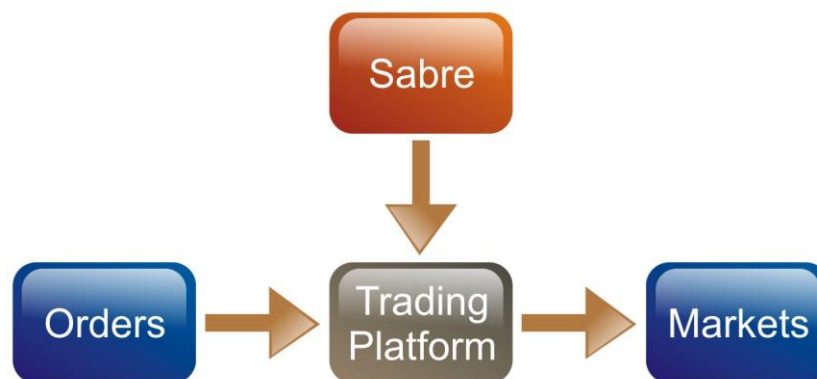
FIGURE 1: The Sabre Implementation Model

Sabre, their cutting edge solution integrates with their client’s trading platform to automate the planning and execution of institutional worked-order business related to any exchange-traded instrument including equity, fixed income, currency and derivative products.